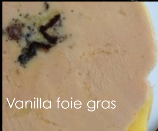
Vanilla foie gras

Free delivery on all orders over £95 Order placed by 17th Dec for delivery by 22 and 23th Dec Free delivery london and outside london depending of order