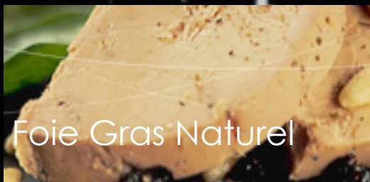
Foie Gras Naturel

If you are looking for a smooth, creamy caviar for the more amateur palate, then Diva is exactly what you are looking for.